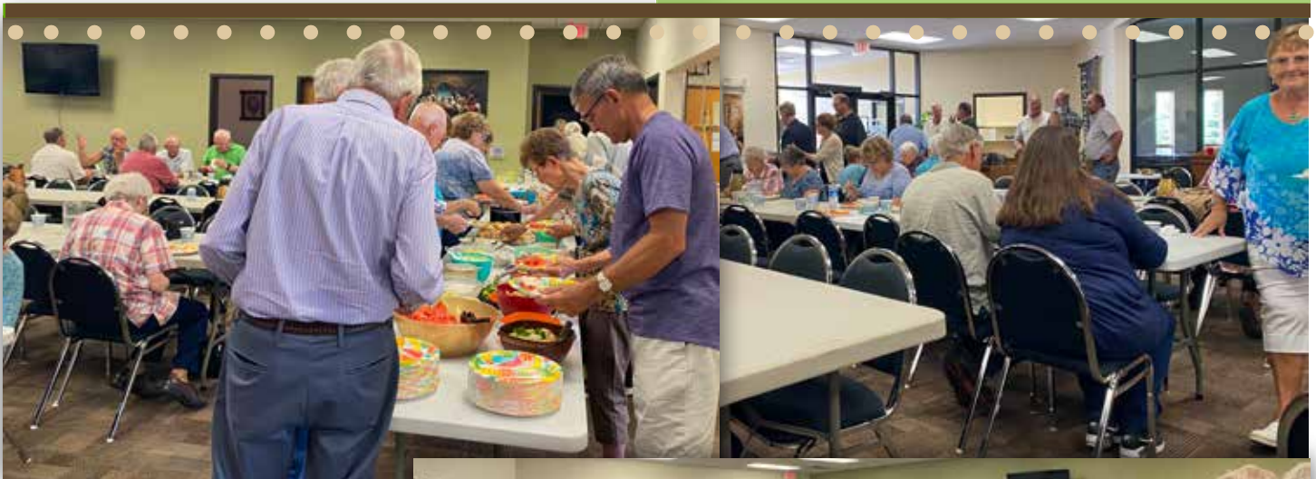
Photos from the July 10 potluck