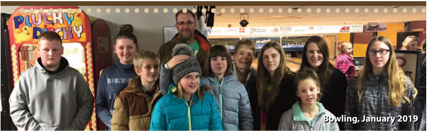
Bowling, January 2019

The New Year has begun and we are back in full swing after the Christmas break.