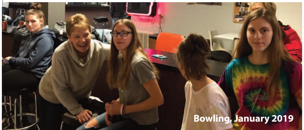
Bowling, January 2019